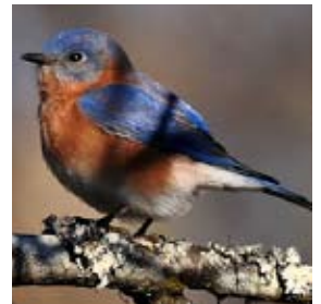
Eastern Bluebird, male

On a late November day, a flash of blue caught my eye out the window. I stuck my nose to the glass and spotted an Eastern Bluebird. I called over other staff and volunteers to enjoy this sight with me. As we sat and watched these beautiful birds flying around, we counted at least nine other species of birds all searching for food around the administrative office. After spending nearly ten minutes watching out the window I realized I had